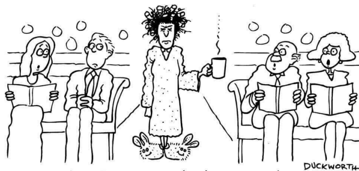
Mrs. Jones got a little too used to watching online worship from home.

Attached is another quiz to keep your brain active. And just in case we are all getting a little too comfortable with the freedom of worship in our own homes, here is a cautionary reminder for the first post - lockdown service!